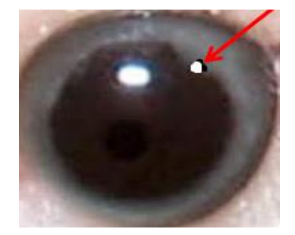
Figure 1: The white stripe (Pars Planar) divides the back and front of the mouse/rat eye. The needle should pierce right on the front of the Pars planar (the anterior side of the eye).

9. Place dissection scissors within the puncture, and rotating the eye using the forceps cut around the eye, until the entire anterior segment (the entire bit in front of the pars planar) has been removed.